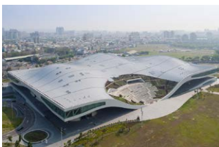
National Kaohsiung Centre for the Arts, Taiwan