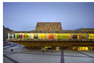
La Llotja Theatre and Conference Centre, Lleida, Spain