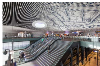
Municipal Offices and Train Station, Delft, NL