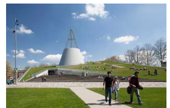
Delft University of Technology Library, NL