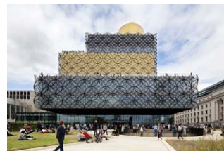
Library of Birmingham, UK