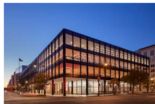
Martin Luther King Jr. Memorial Library, Washington D.C., US